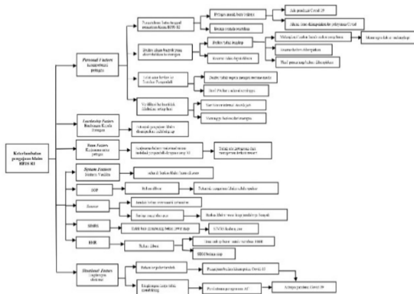
Figure 2. Problem Tree Analysis of the Causes of Delay in Submitting Inpatient BPJS Claims

In line with Sophia & Darmawan (2017) research, several factors that cause delays in claims are due to facilities and infrastructure such as problems with applications and the internet, no bridging system, and there are hospitals without a billing system. Electronic Medical Record (EMR) is the use of electronic media so that all patients' medical records are stored in a database management. With the EMR or RMK, it will be easier for officers in the process of submitting claims for inpatient BPJS, so they do not need to scan one by one the claim requirement files, but simply by downloading the notes and results of the patient examination on the EMR. Meanwhile RSU dr. H. Koesnadi Bondowoso has not used this EMR due to the large funds and unqualified human resources at the hospital. EMR is very important for hospital management because they provide integrated and accurate data as well as a solution to improve cost efficiency, increase access and service quality. However, its implementation has many challenges, one of which is the lack of organizational readiness. This is one of the factors that cause health facilities to fail in implementing EMR (Wirajaya & Dewi, 2020)..