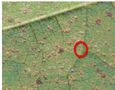
Picture 1. Symptom of rust attack on the under surface of soybean leaf (Ramlian and Nurjanani, 2011)

According to Santoso and Sumarmi (2013), leaf rust disease attacks some plant parts like leaves, stalks and stems. The symptom of leaf rust disease occurs when little spots on the leaves consisting gray uredium will gradually turn into dark brown. Those spots are visible before the boils (postule) burst. The spots seem like having angles because of the leaf bones restriction especially near the infected leaves. The spots are surrounded by yellow halos/rings. Then, the spots start to get bigger or united and becomes to have dark brown color or even black when the plant starts to bloom (Picture 1). The symptom of leaf rust disease usually is started from the leaves on lower parts to the younger leaves. The spots are usually found on the under surface of leaves, but some of them are also found on top surface of the leaves. Leaf rust disease often attacks the old soybean plants. There will be color changing of the infected leaves from green to brown, and then the leaves become dry and fall out. The leaf rust attack on soybean seeds will cause the seeds become empty (Fachruddin, 2000).