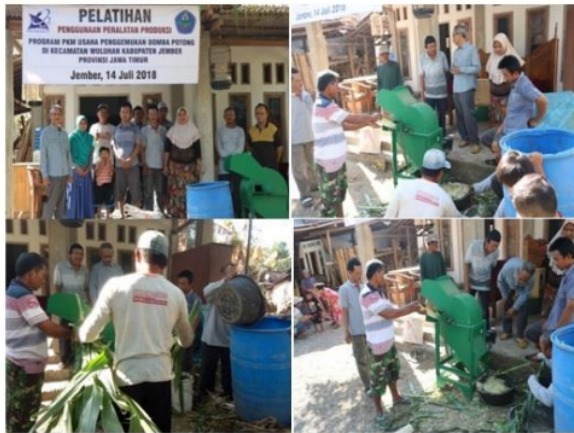
Figure 4. Training on the Use of Feed Chopper Machines