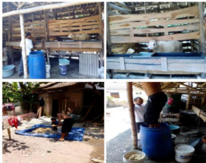
Figure 2. Business Condition own by Mr. Abdul Karim

Sheep feed that is most widely used by partners is wet fermented feed or known as silage made by both partners manually. The composition of the feed made consists of ingredients: banana stems, SOC (Liquid Organic Supplements), bran, tofu pulp, sugarcane drops and water. The flow chart image of the SOC HCS feed fermentation method for the production process is shown in Figure 3.