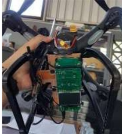
Fig. 3. Integrated anemometer below the drone.

For anemometer power supply users can get the power from drone battery. This process can save a weight of the prototype. Because the differences between the drone battery voltage output and current are different from anemometer Input voltage, users cannot just connect cable from drone battery to anemometer battery. The drone battery is 12 V and the anemometer battery is only 6 V. Users must add some resistor to compliance the problem. In this prototype, reserachers use a regulator to step down the voltage from 11.1 V output from drone battery to 9 V for anemometer input voltage. This process success step down the voltage of the drone battery to safe anemometer input voltage.