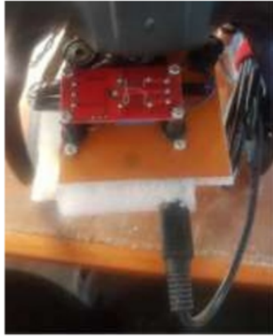
Fig. 5. Radio receiver added to anemometer for precise time data recording.

This data recording remote control receiver for data retrieval control, requires a voltage of 5 V and is taken from the drone battery after being reduced from 11.1 V to 5 V using a DC regulator.