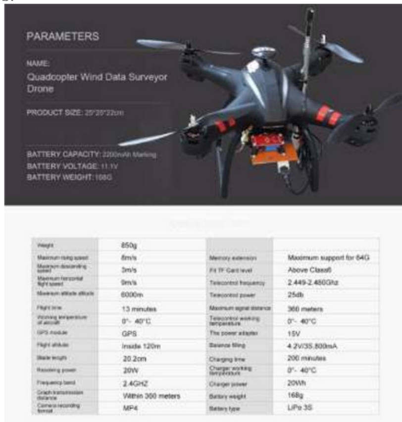
Fig. 2. Quadcopter parameters.

From preliminary flight testing, researchers found the battery life to be roughly 10 min in low-wind conditions, allowing enough time for data collection. However, the battery life is subject to change based upon wind condition and flight plan. Currently, the copter is controlled by remote with a feature to turn back home and following the pilot with usage of GPS.