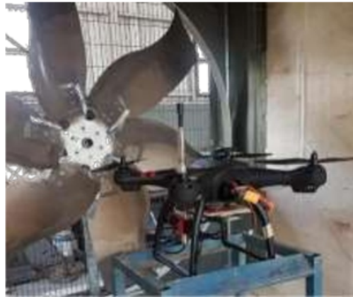
Fig. 6. Complete prototype of anemometer quadcopter surveyor drone.

This data recording remote control receiver for data retrieval control, requires a voltage of 5 V and is taken from the drone battery after being reduced from 11.1 V to 5 V using a DC regulator.