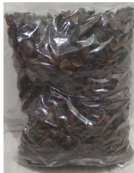
Fig. 3. Coffee Skin Waste Animal Feed Products

The ingredients for making cascara tea are 100% red arabica coffee beans. The raw material in the form of red bean coffee husk waste is then processed in the following stages: