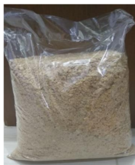
Fig. 2. Coffee Skin Waste Animal Feed Products

All materials used to produce animal feed are then calculated in order to determine the selling value of the finished animal feed product. The process of analyzing the economic value in this study was carried out by calculating the cost value required for each manufacture of coffee skin waste products. Cost analysis is an important information for Sumber Kembang farmer group because this information will be used to determine product price and profit / loss if the product will be sold [9]. The cost calculations performed in this study are variable costs only. This is because this product is an innovative product that has not been sold to the market, so there are no other costs attached to the product. Variable costs determined costs are determined by the level of production volume and controlled by management [10]. The cost calculation for 1 package of 2 kg compost fertilizer is as follows: