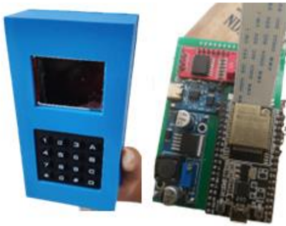
Figure 4 IoT hardware

In this section, we have created the hardware device as shown in Figure 4 (1). The function of this device is to facilitate data input by field personnel. This hardware device is designed to operate on low power and can be powered by a power bank.