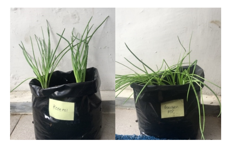
Figure 1. Result pathogenicity test, (left): control, (right): Foc inoculation

The results of Foc inoculation showed the same symptoms as fusarium wilt disease. The treatment of Foc pathogens caused the plants to become twisted, collapsed, and wilted. While the control treatment did not cause disease symptoms (Figure 1). This is in accordance with the statement of Wiyatiningsih et al., (2009), reported that common symptoms of the disease are twisted leaves, the color of the leaves is pale green, but does not wither. When diseased plants are removed, the tubers appear smaller, fewer than healthy ones.