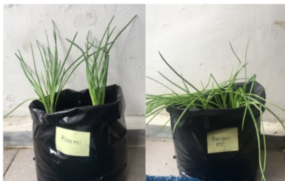
Figure 1. Result pathogenicity test, (left): control, (right): Foc inoculation

The results of Foc inoculation showed the same symptoms as fusarium wilt disease. The treatment of Foc pathogens caused the plants to become twisted, collapse and wilted. While the control treatment did not cause disease symptoms (Figure 1). This is in accordance with the statement of Wiyatiningsih et al., (2009), reported that common symptoms of the disease are twisted leaves, the color of the leaves is pale green, but does not wither. When diseased plants are removed, the tubers appear smaller, fewer than healthy ones.