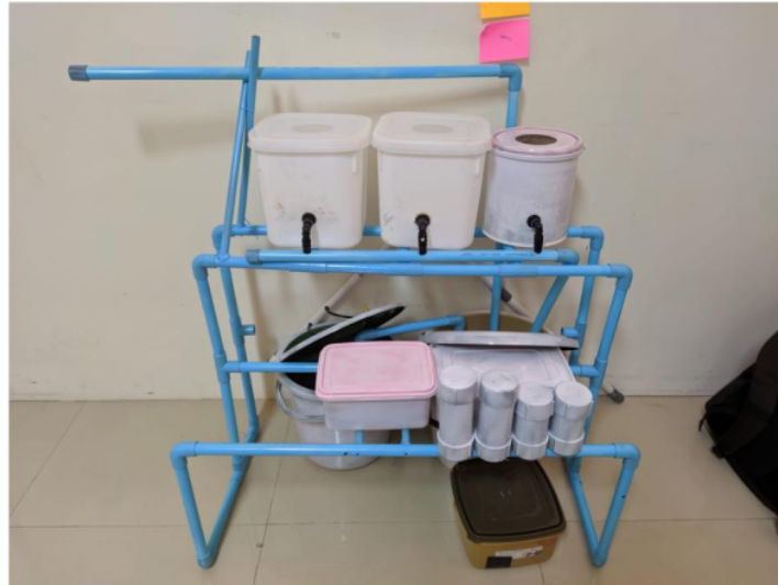
Figure 3. Implementation Hardware