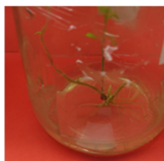
Figure 3. Shoots formation in MS medium containing 90 g.L -1 sucrose

a The number followed by the same letter are not significantly different at (p<0.05) level of Duncan's test.