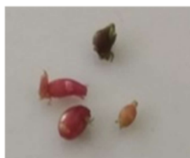
Figure 2. 90 days old microtubers of red potato

Based on the ANOVA test, giving some sucrose concentrations combined with several types of auxin did not show a real effect. The emergence of microtubers ( Figure 1 ) was first seen in the media with the addition of NAA and 150 \text{ g.L}^{-1} sucrose at 29.2 DAP ( Table 1 ). In the treatment media also obtained the highest number of tubers, which is an average of 1.5 tubers per plantlet ( Tabel 2 ). Both of these factors show a very real influence on a single basis. The formation of micro tubers is strongly influenced by sucrose as an energy source. Tubers on potato plants are also a place of energy storage for plants. In the process of micro tuber formation, sucrose as an external source of carbon is able to stimulate cell development to form tubers [7], [8]. The higher the concentration of sucrose affects the process of cell differentiation set the Sink tissue [9][10]. This is seen in the media with the addition of 30 \text{ g.L}^{-1} of sucrose is not able to stimulate tuber formation, only grows callus.