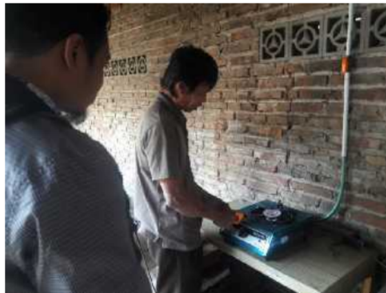
Figure 7. Utilization of biogas for cooking