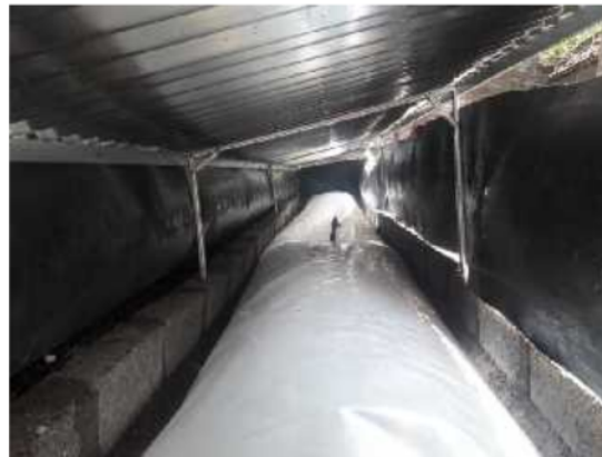
Figure 4. Balloon digester