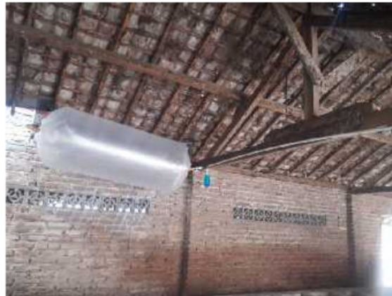
Figure 6. Gas pipelines and gas container

To maintain the availability of biogas everyday for cooking activities as shown in Fig. 7, the balloon digester must be filled with cow waste mixed with water and EM-4 every day with a ratio of 1: 2. It makes the biogas will be produced continuously in a dairy farming at Kaligondo sub-district.