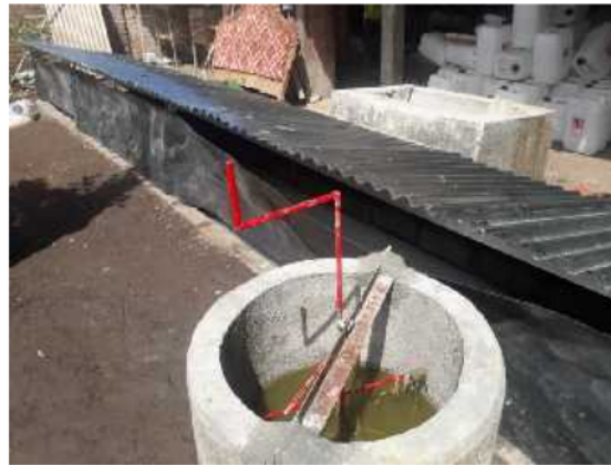
Figure 3. Inlet chamber