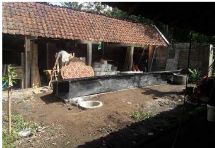
Figure 2. Biogas location behind the cow shed

Furthermore, the slurry of cow waste is left for 13-20 days with the outlet position of the gas valve of balloon digester in closed condition. This condition makes sure that the process of fermentation of organic materials by microorganisms in anaerobic conditions. The results of the fermentation process will be seen on day 14 and usually methane gas has accumulated at the top of the digester. The first gas output formed must be released into the air because it contains a mixture of gas and air.