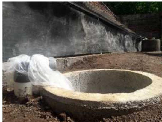
Figure 5. Outlet chamber