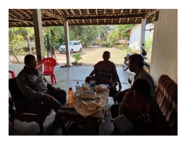
Figure 6. Dialogues and focus group discussion with local community at Gambirono sub-district