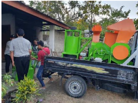
Figure 5. Waste processing technology including compost and plastic paving