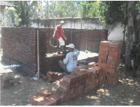
Figure 4. Material recovery facility for waste processing