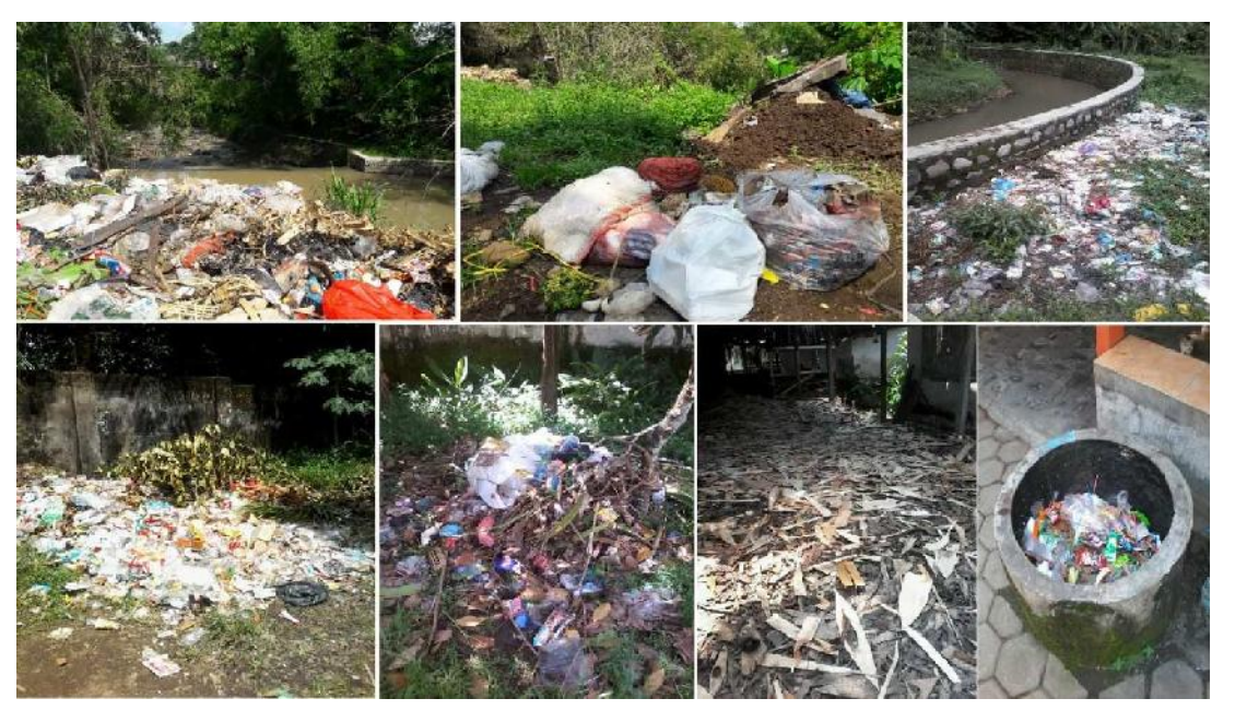
Figure 1. Dumping of waste at Gambirono sub-district, Jember

Gambirono sub-district is one of rural in Jember district, East Java, Indonesia facing waste management problem in which community environmental awareness is low. Many organic waste left over from agricultural products or wood processing is left scattered or stacked in the yard. The production of plastic and other inorganic waste from households, schools or industries is increasing, but because it does not have a landfill or waste processing, the garbage many are thrown into rivers, highways, yards or buried by making puddle of land for residents who own a yard. Environmental problems are occurred in Gambirono sub-district shown in Figure 1. In addition, flood conditions in the season rain has become commonplace due to piles of garbage clogging gutters, overflow of rivers due to siltation due to garbage. This is a source of dengue fever and diarrhea. There is standing water when it is raining community mobility to work because there are still many village road infrastructure unpaved or asphalt.