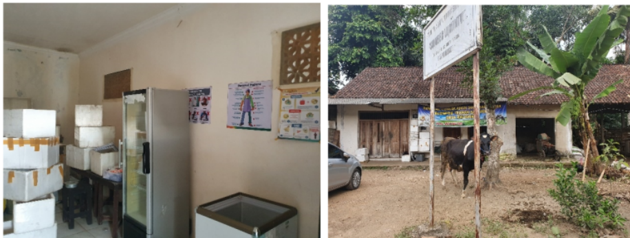
Figure 1. Collecting Data in CV Indo Dairy Milk Kaligondo Village

Target from Data collection activity are to know members of CV Indo Dairy Milk in GMP processing products and apply it to respective processing units based on check list of ratings aspects of GMP through direct observation before and after GMP application. This survey data / data collection (preparation) was held on February 2020.