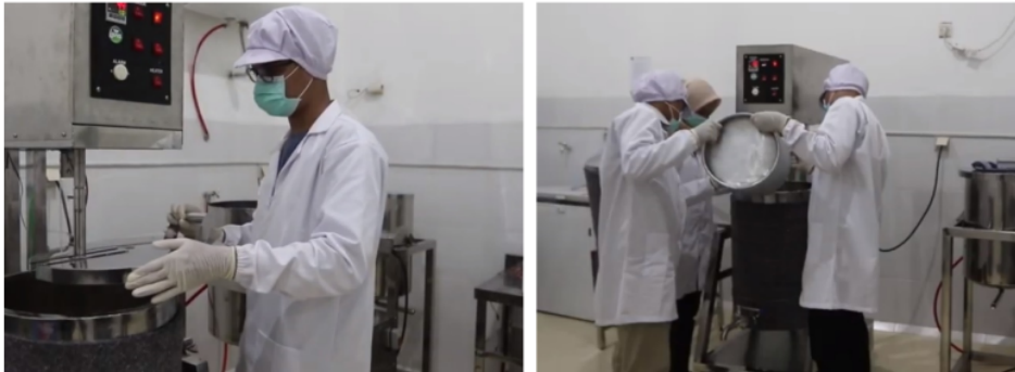
Figur 3. Personal Hygine Aspect of GMP on Processing Unit

From the aspect of the pest control system, it also shows an increase, where before the application the value is 60.0 after implementation becomes 85.0. Pest control system aspects are also a concern for improvement because frequent contamination caused by pests that enter the production room. It is necessary to take the minimum possible steps that already exist in the requirements of the pest control system to prevent this by providing given the seal of PVC plastic curtain between space production (Shows in Figure 4) and providing a cover on each of the existing air net vents.