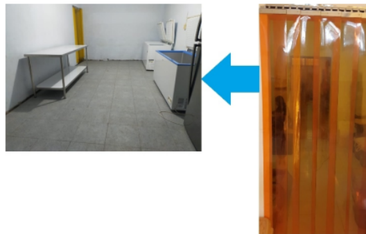
Figure 4. Seal of PVC plastic curtain between space production

From the aspect of the pest control system, it also shows an increase, where before the application the value is 60.0 after implementation becomes 85.0. Pest control system aspects are also a concern for improvement because frequent contamination caused by pests that enter the production room. It is necessary to take the minimum possible steps that already exist in the requirements of the pest control system to prevent this by providing given the seal of PVC plastic curtain between space production (Shows in Figure 4) and providing a cover on each of the existing air net vents.