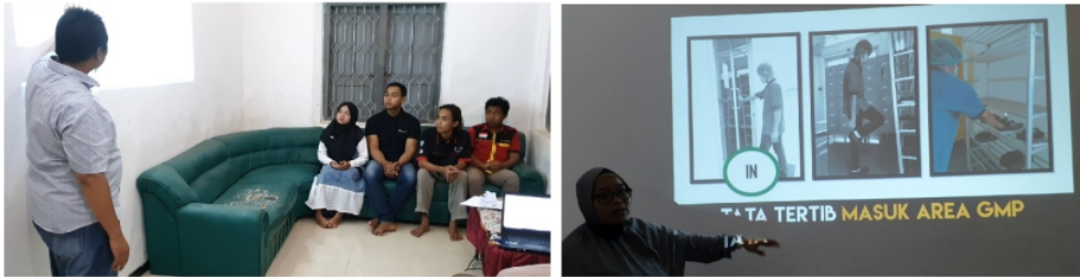
Figure 2. Delivering Process material Aspect of GMP Standard

This training activity was attended by 30 participants include owner and employees and was held on February 2020 after preparation activity. During training activities of standard GMP Processing units, participants was very enthusiastic in following and listening the explanations. Delivering material of GMP standart can be seen on figure 2.