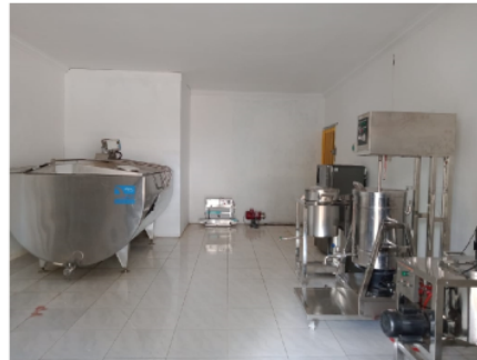
Figure 5. processing room shows

GMP Aspects in production process unit. It indicates that CV Indo Dairy Milk, Kaligondo Village has started to implement GMP principle in their processing unit product to increasing quality of their products.