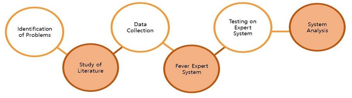
Figure 1. The Block Diagram on Fever Expert System Research

This expert system consists of several stages, namely problem identification, literature study, data collection, making a fever expert system, system testing, and system analysis as shown in Figure 1.