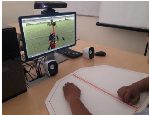
Fig. 1. VR-MT simulation where a participant has pain on left hand

The VR-MT system is created by free version of Unity 5.4 with a first person perspective views as shown in Fig. 1 and Fig. 2. To improve perception of self-motion and immersion, the choice of field of view (FoV) in VE is 80°. The choice of color contrast and texture in VE are selected high to give a striking difference between objects in VE including line, tree, avatar, background scenery, apples and bombs. The objects in our VE are scaled to real-world proportions to present more immersion. The goal of design process is to create an adequate scenery mirroring view. The choice of avatar is taken from default examples of Microsoft Kinect Unity SDK. Scripts are written in C# to customize and have control over the VE during the trial. The monitor display is placed on a table, whereas Microsoft Kinect is placed on top of monitor display. A participant takes a seat in front of Microsoft Kinect at the distance of 1.5-2 meters from it for capturing upper limb motion. The limb where a participant has pain acting as a hand controller to move virtual limb when catching apples or avoiding bombs. When a participant failed when hitting a bomb, it will turn on visual feedback through monitor display. It indicates that a participants had done wrong motion.