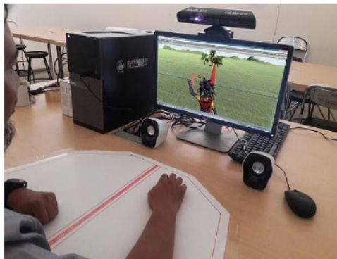
Fig. 2. VR-MT simulation where a participant has pain on right hand