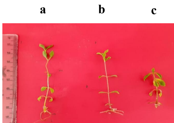
Figure 2. Growth of stevia plantlets at the age of 30 DAS on basic media; a) Full MS; b) 1/2 MS; c) 1/4 MS

The number followed by the same letter are not significantly different at ( p < 0,05 ) level of Duncan's test.