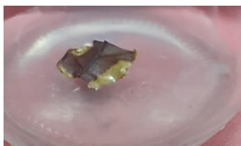
Figure 4. Partial browning explants in the sterilization method 2