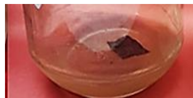
Figure 5. Overall browning explants in the sterilization method 3

In general, browning in plants occurs due to stress conditions and the oxidation process of phenolic compounds that come out due to explant injury [15], [16]. In addition, the type and concentration of sterilant ingredients are also able to stimulate the appearance of browning. As in the treatment tested, sterilization method 3 stimulated the highest explant browning, namely 62.5% ( Figure 5 ), and sterilization method 2 stimulated 20% browning ( Figure 4 ). The use of HgCl 2 or Mercury Chloride was suspected to be the cause of browning in treatments 2 and 3 because both treatments used HgCl 2 in the series of sterile materials. Mercury Chloride is a sterilant that is highly toxic not only to microbes but also to explants and humans. Explants that were sterilized in treatments 2 and 3 were seen to have browned in some of the explants. However, some had all of the explants browned. Browning is one sign that the explant cells are dead [17].