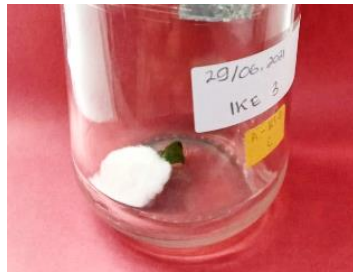
Figure 1. Explants contaminated with fungi

emergence at 10 DAI. One study stated that HgCL 2 (Mercury chloride) is highly toxic to microbes, and can cause certain concentrations [11].