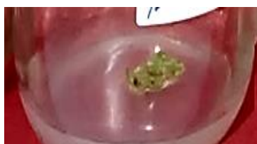
Figure 3. Healthy explants from sterilization method 1

In method 1, it is assumed that the concentration is optimal and safe for the cells in the leaves so that it does not cause death in the leaf cells ( Figure 3 ). The use of Sodium hypochlorite (NaOCl) is a sterile material that has low activity so that the explant cells do not become stressed and injured. However, if these materials are used at high concentrations, they can cause cell injury (necrosis) and eventually die and then visually turn brown or browning [14].