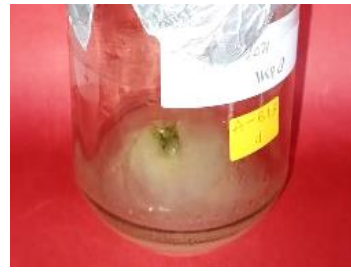
Figure 2. Explants contaminated with bacteria