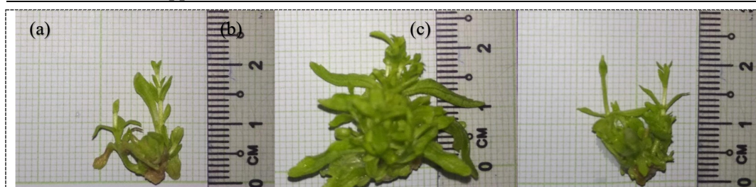
Figure 2. Stevia rebaudiana Bertonii plantlet from internode explant (30 DAP) grown on (a) MS+0,25 ppm IAA+2 ppm BAP; (b) MS+0,25 ppm IAA + 3 ppm BAP; (c) MS+0,25 ppm IAA+ 4 ppm BAP

a The number followed by the same letter are not significantly different at ( p < 0.05 ) level of Duncan's test.