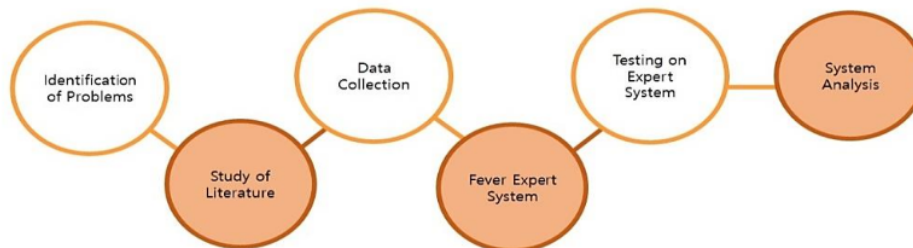
Figure 1. The Block Diagram on Fever Expert System Research

This expert system consists of several stages, namely problem identification, literature study, data collection, making a fever expert system, system testing, and system analysis as shown in Figure 1.