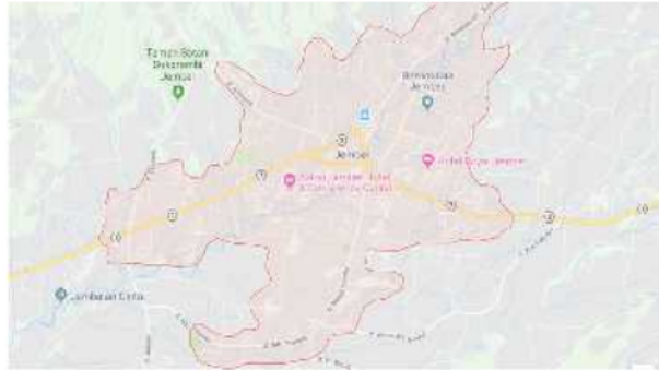
Picture 1. Jember

government to plan a prevention or treatment of diseases in Jember Regency. The developed system is shown by Figure 1.