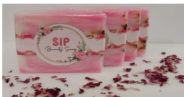
Figure 2. Coffee Peel Extract as natural antimicrobial in coconut oil soap