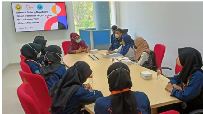
Figure 1. Visiting UNEJ Tax Center

Establishing TEFA was begun with the initiation of a study program by the management of the Agribusiness Management Department and the Director of the Politeknik Negeri Jember. The most important thing from this activity was the coordination and communication so that an understanding could be obtained regarding the establishment of TEFA Tax Center. Communication and coordination are the primary keys to achieving an organization's goals [13]. If in an organization-organization, in this case Politeknik Negeri Jember, good communication and coordination have been carried out, the establishment of TEFA Tax Center would also be achieved. Currently, the public sector accounting study program has formed a tax Center by visiting the Tax Center of FISIP UNEJ, to obtain the information related to the establishment process and work program of the UNEJ Tax Center. The pictures of a visit to the UNEJ Tax Center presented in Figure 1.