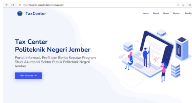
Figure 2. Tax Center Website Display

The Tax Centre website was expected to be a marketing medium for TEFA Tax Center Politeknik Negeri Jember, and as a general source of information to the public regarding the tax information. The establishment of TEFA Tax Center can undoubtedly have an impact on state revenues. This is because most state revenue is from taxation [14]. TEFA Tax Center is expected to increase public awareness and compliance to increase tax revenues. The website can be used as a marketing medium [15].