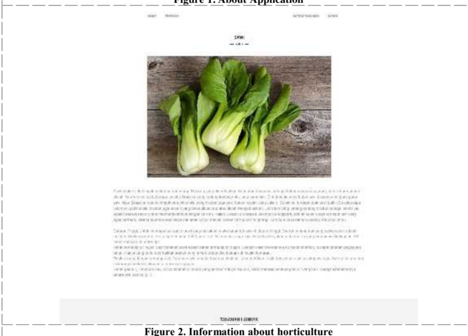
Figure 2. Information about horticulture