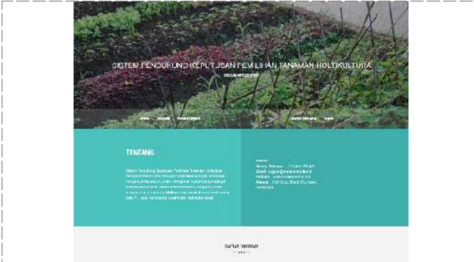
Figure 1. About Application

The application consists of two users, namely users and amen. The user page that will get information about horticulture plants, growing requirements and can analyze the selection of horticulture plants suitable for planting based on PH, temperature, rainfall and soil highlands. Admin page that will input, edit and delete information about horticulture plants and perform knowledge representation figure 1 – 4: