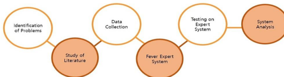
Figure 1. The Block Diagram on Fever Expert System Research

This expert system consists of several stages, namely problem identification, literature study, data collection, making a fever expert system, system testing, and system analysis as shown in Figure 1.