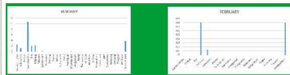
Figure 4. Graph