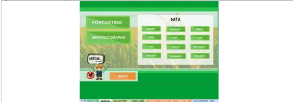
Figure 2 Application Forecasting

This study forecasting application system use a linear method with three parameters rainfall (CH), rainy Day (HH), losses to the Area of Attack (LTS). There are two applications for predicting planthopper pest attacks and tungro disease attacks. Figure 2 – 5.