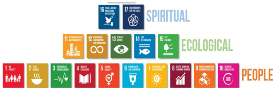
FIGURE 1. SDG's 17 goals

mission. The SDGs concept was born at a conference on sustainable development organized by the United Nations in Rio de Janeiro in 2012 [1]. The purpose of this meeting is to develop common goals to harmonize environmental, social and economic aspects. To protect people, planet, wealth, peace and partnerships, will be achieved in 3 noble goals by 2030, namely poverty alleviation, attainment of gender equality, and mitigating climate change, as seen in Figure 1.